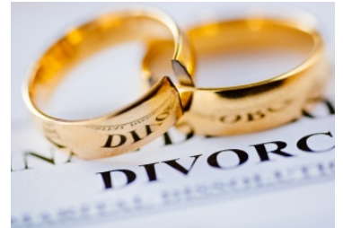
The 21 jobs that are MOST likely to lead to divorce