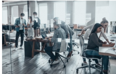
This is what work will look like in 2030, and it isn't pretty