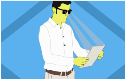
Is the Black Hole due to your resume?